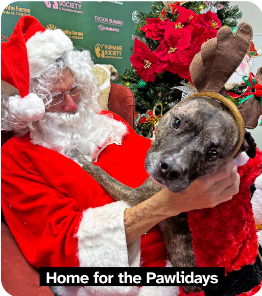
Home for the Pawlidays

cats supported through the Trap, Neuter, Return program