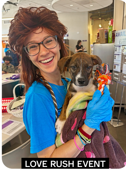
LOVE RUSH EVENT